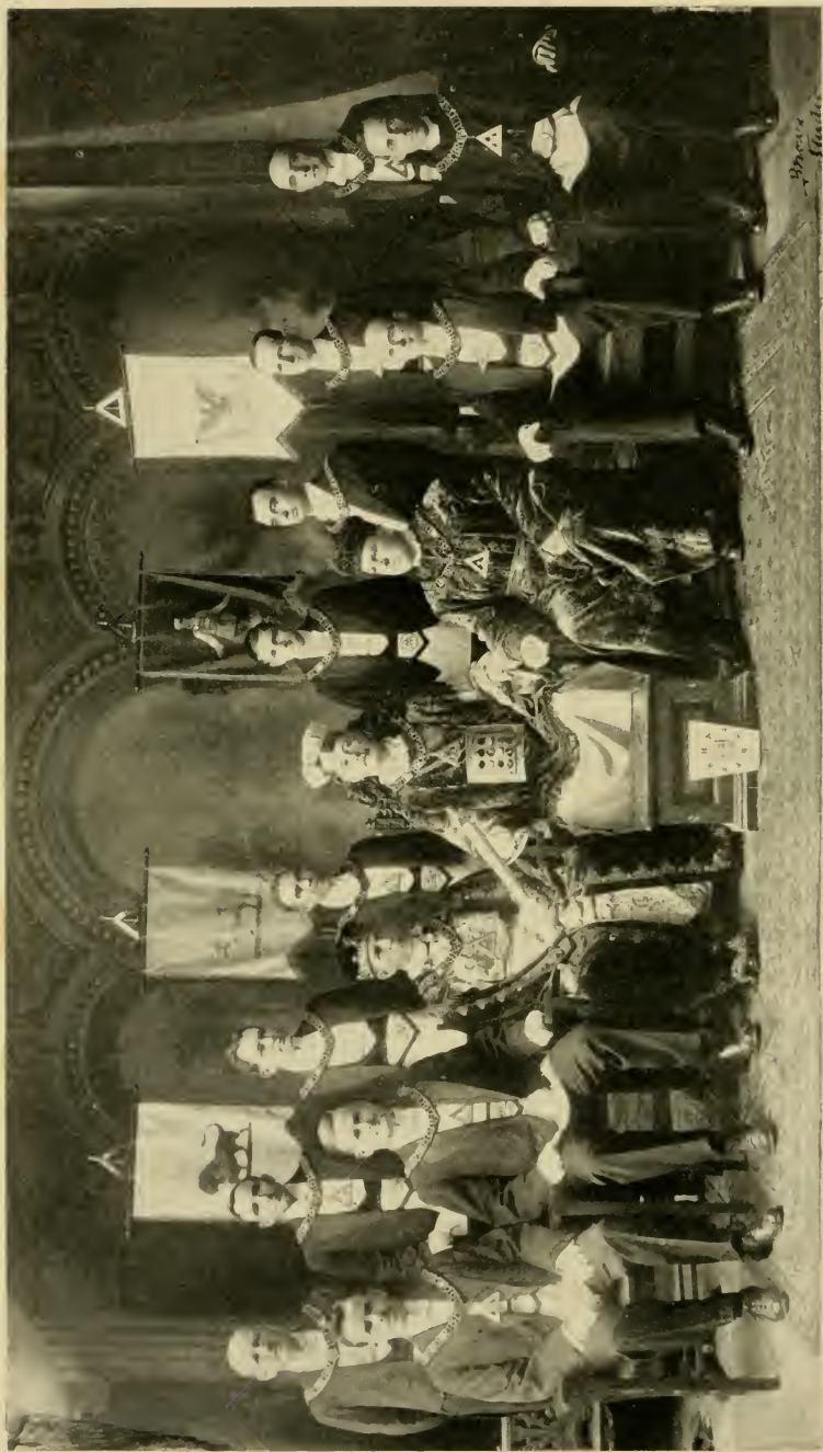
OFFICERS OF ADONIRAM ROYAL ARCH CHAPTER 1916